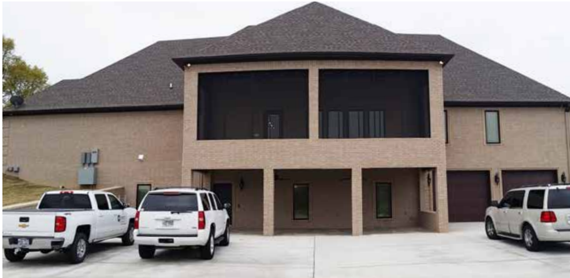
Back of home - covered deck and walk-out basement.