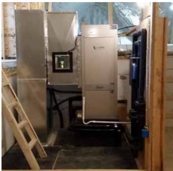
Left: GeoComfort Navigator Packaged geothermal system installation in attic utility area.