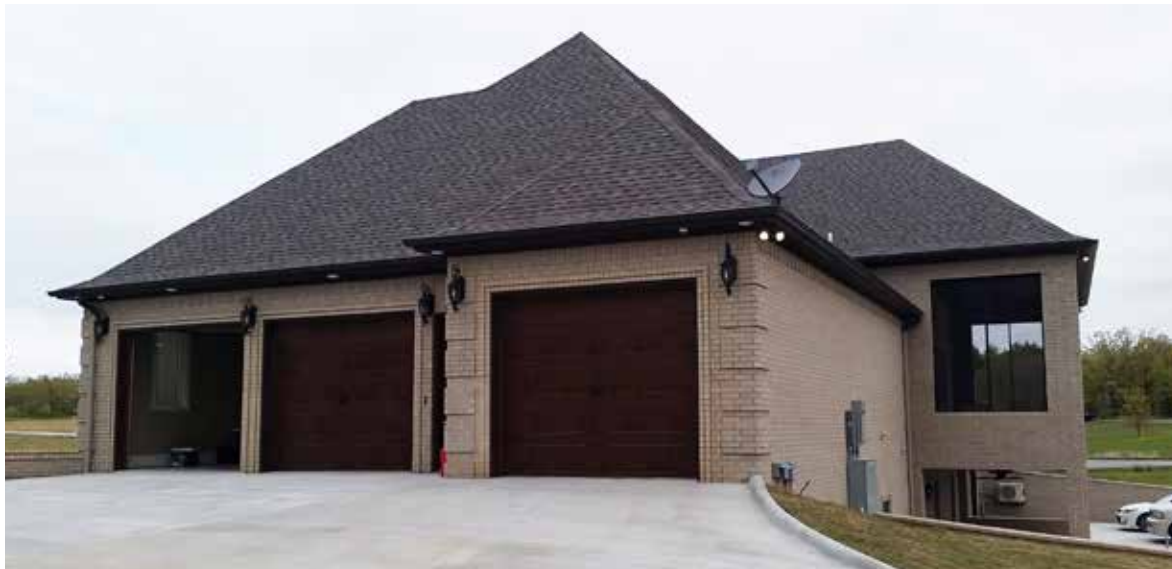
Side view of home.