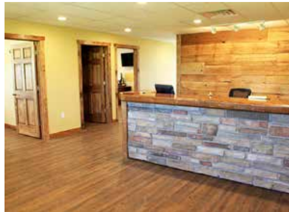
The maintenance and office areas are conditioned by the geothermal system.