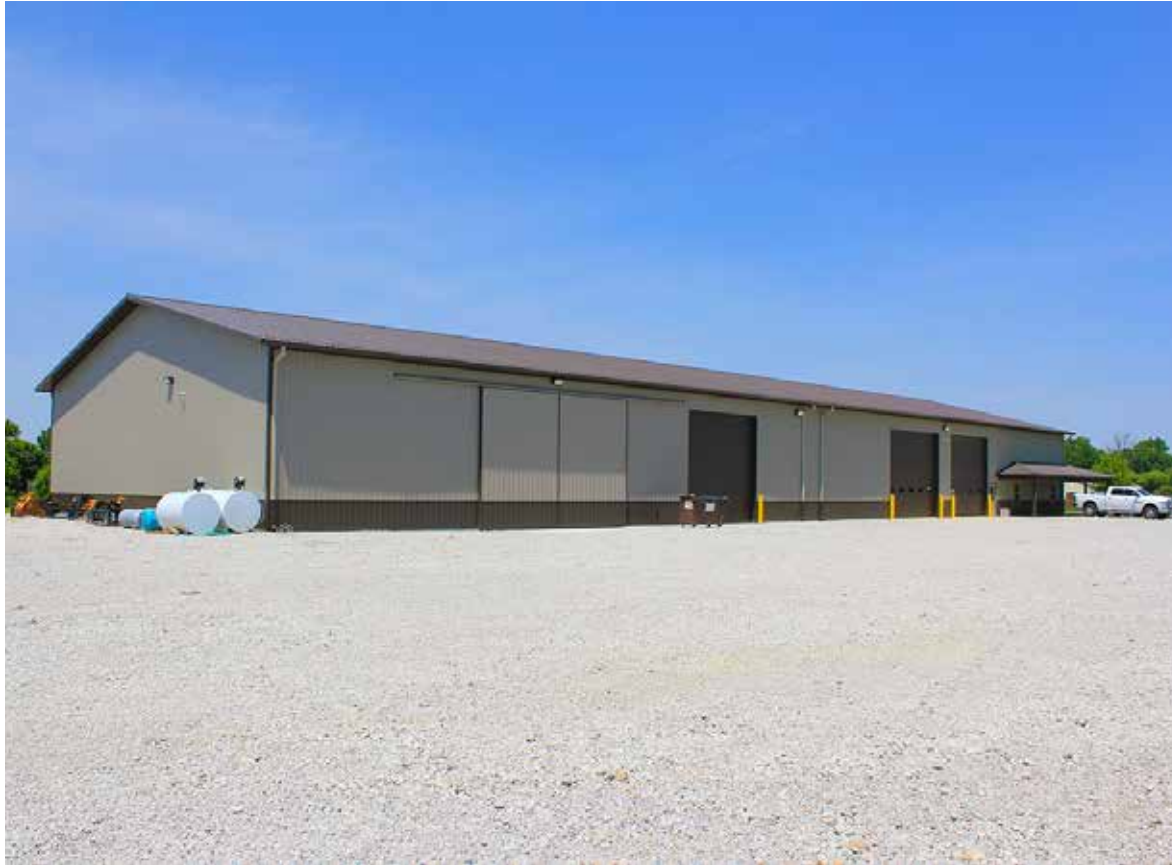
The building features office space, as well as maintenance and dry storage for heavy equipment.