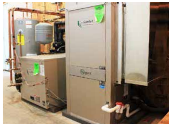
The ground loop system is a horizontal racetrack configuration.